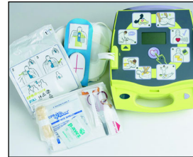
CPR-D•padz come complete with rescue essentials including a barrier mask, a razor, scissors, disposable gloves, and a towelette.

ZOLL's new CPR-D•padz protect the electrode elements with a novel design that sacrifices a non-critical element in the electrode to control the corrosion process and allow an unmatched four-year AED electrode life. ZOLL's CPR-D•padz reduce electrode replacement costs, facilitate AED readiness and maintenance, and decrease the probability of an AED's failure due to electrode expiration.