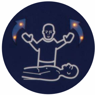
Stand clear of the patient

Press to deliver shock when prompted. Button illuminates.